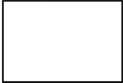
Character sketch, symbol or physical description